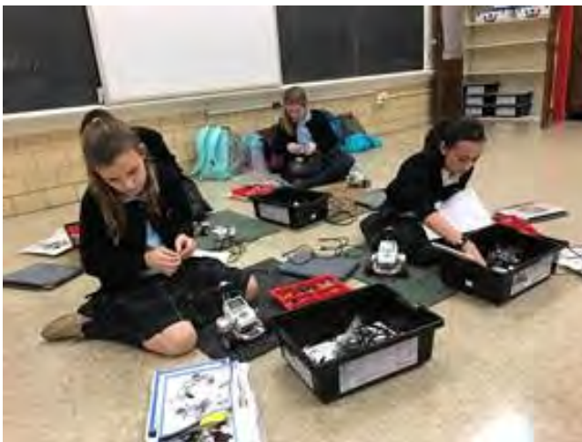
Building robotic “ambassadors” for Catholic Schools Week

Teachers and students alike get to work in our Robotics lab!